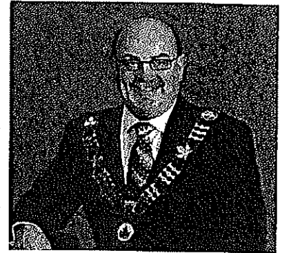
MAYOR - MAIRE GARY MCNAMARA